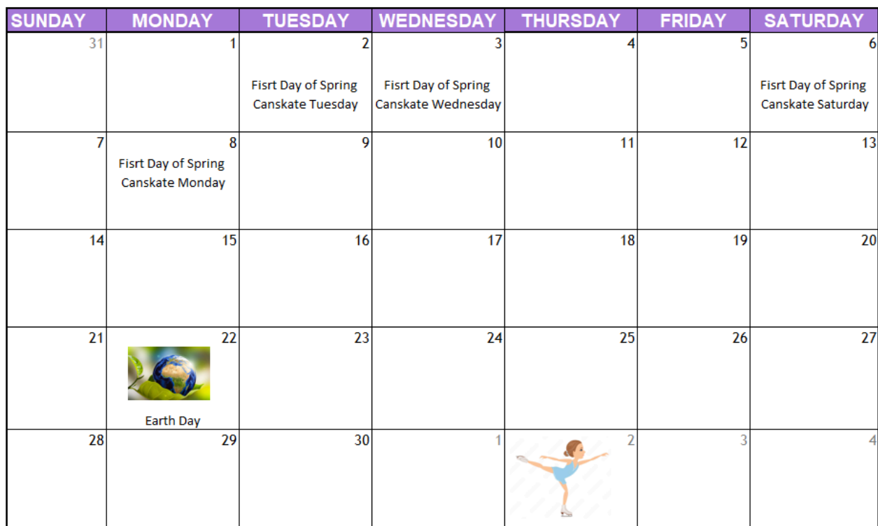
Figure 8 SKATING CLUB